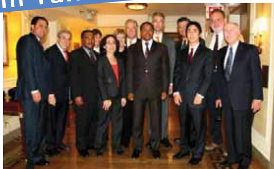
Above: The MCW Oral Healthcare Program delegation with H.E. President Jakaya Mrisho Kikwete of Tanzania (front, center).

The third phase of the project will focus on faculty development.