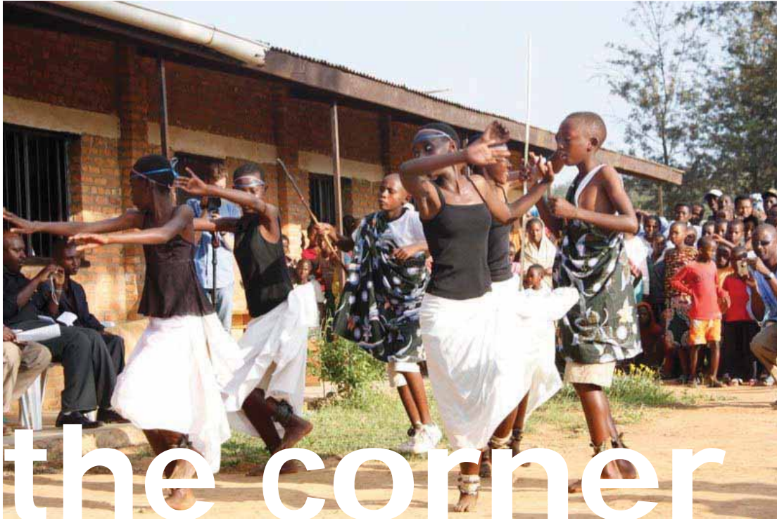
Above: The Groundbreaking Ceremony of the newest MCW community center in Rwanda in December 2008.

Miracle Corners of the World 166 Madison Avenue, Fifth Floor New York, NY 10016, USA Phone: +1.212.453.5811 | Fax: +1.212.213.4890 info@miraclecorners.org | www.miraclecorners.org