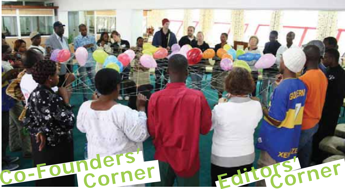
Above: Participants and facilitators at the Community Development Seminar in Arusha, Tanzania in May 2008.