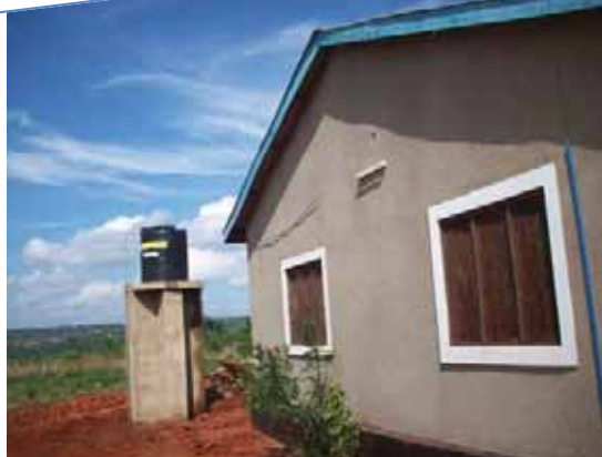
Above: The MCT-S Dental Clinic in Songea.

The goals of this trip were slightly different from those of previous trips. There were three major goals, all of which were accomplished. The first goal was to set up infection control procedures including sterilization at the site. The second was to train Bilal, the local dental therapist, on the latest techniques in restorative procedures and materials for both children and adult dentistry. And the last goal was to do a complete inventory of all supplies and organize it electronically making it easier to keep track of supplies used, needed and expiration dates of certain