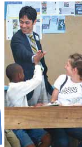
Above: Members of the Perfect Youth Group at the MCT-A community center.