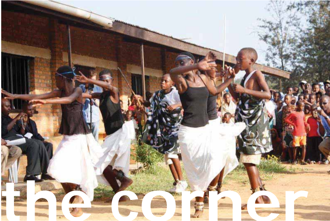
Above: The Groundbreaking Ceremony of the newest MCW community center in Rwanda in December 2008.

Miracle Corners of the World 166 Madison Avenue, Fifth Floor New York, NY 10016, USA Phone: +1.212.453.5811 | Fax: +1.212.213.4890 info@miraclecorners.org | www.miraclecorners.org