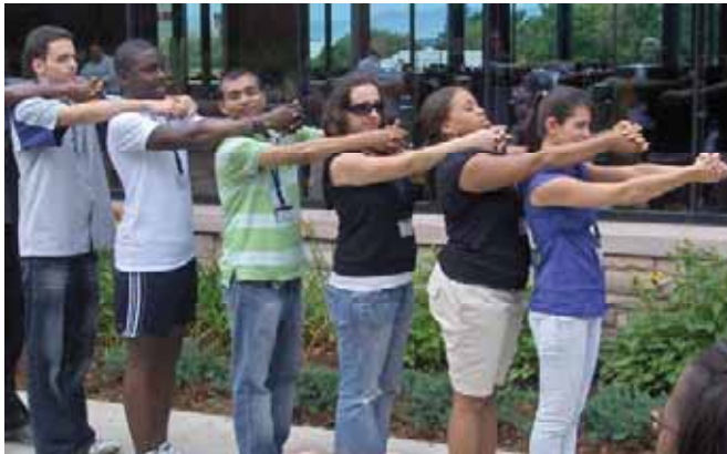
Above: Participants at the 11th Youth Leadership Retreat.