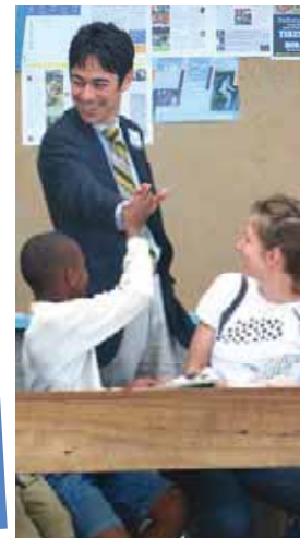
Above: Members of the Perfect Youth Group at the MCT-A community center.