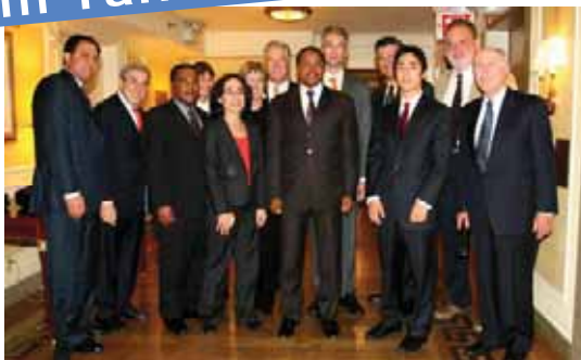
Above: The MCW Oral Healthcare Program delegation with H.E. President Jakaya Mrisho Kikwete of Tanzania (front, center).

The third phase of the project will focus on faculty development.