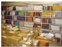
Donated books in new library in Iringa.