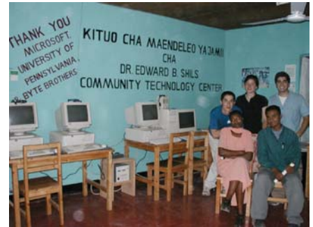
MCW friends at the Dr. Edward B. Shils Computer Technology Center in Arusha.

MCW partners interested in learning about Tanzania, its culture and people, as well as going on safaris and climbing